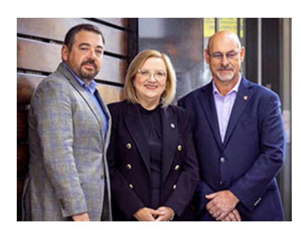
Unifor supports the social movement against the French government's pension reform bill. Read our statement.