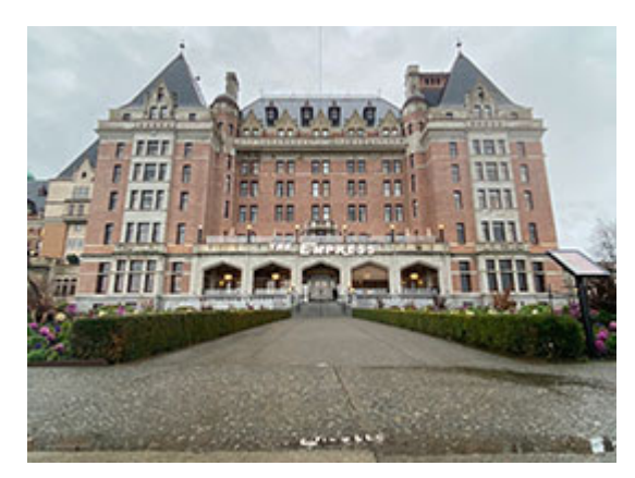
Fairmont Empress Hotel members win historic gains as new collective agreement increases wages 14.5% over three years plus Cost-of-Living Adjustment while securing a more manageable workload.