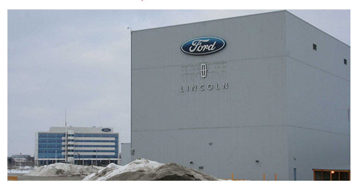
Ford Motor Company reaffirms $1.8 billion investment and announces plans to retool and rename the Oakville Assembly Complex to the Oakville Electric Vehicle Complex.