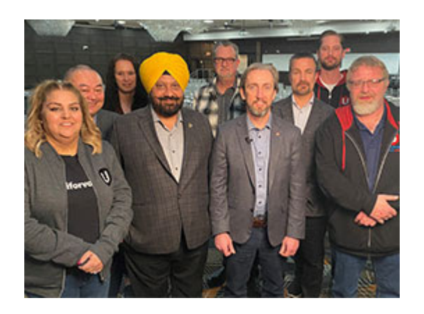
Coast Mountain Bus Company members from Unifor locals 111 and 2200 achieve wage increases and benefits enhancements in new collective agreement.