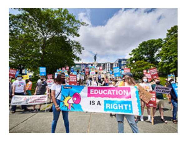
The 2023 Unifor Scholarship application period is now open! Each year, the scholarships are awarded to children of Unifor members enrolling in their first year of post-secondary training or education.