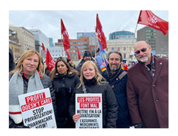
The Supreme Court of Canada has dismissed Cambie Surgeries Corporation's attempt to overturn the BC Medicare Protection Act.