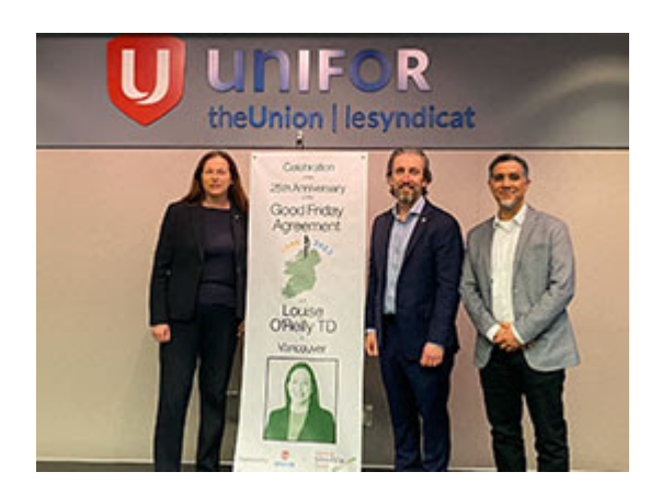
Ahead of the 25<sup>th</sup> anniversary of the Good Friday Agreement – which marks the historic Northern Ireland peace process – Unifor hosted the Sinn Féin spokesperson on Enterprise, Trade and Employment in New Westminster, B.C.